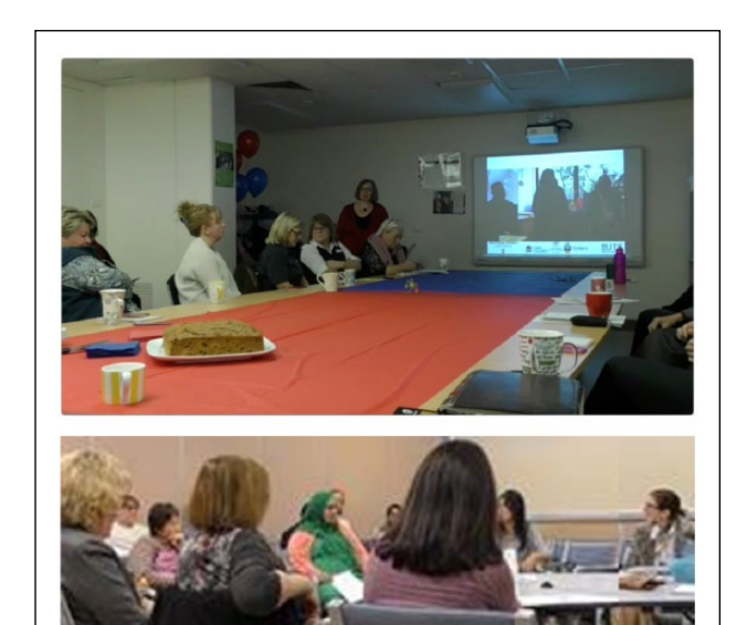
Figure 2. Reflexive sessions across the two sites.